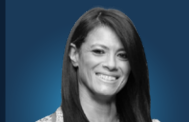
Dr. Rania Al-Mashat Minister of International Cooperation of Egyptian Government