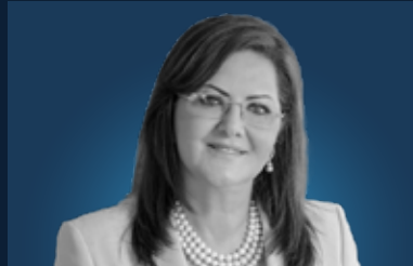
Dr. Hala El-Said Minister of Planning and Economic Development