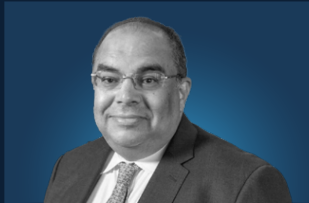
Dr. Mahmoud Mohieldin

UN Climate Change High Level Champion for Egypt